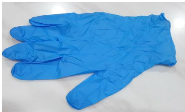
Photo: Disposable Nitrile Examination Gloves